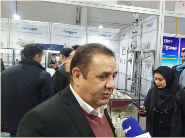
↑ Media Interviews and Industry Engagement