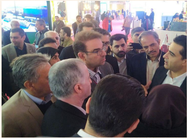
↑ VIP Delegation Visits and Business Networking