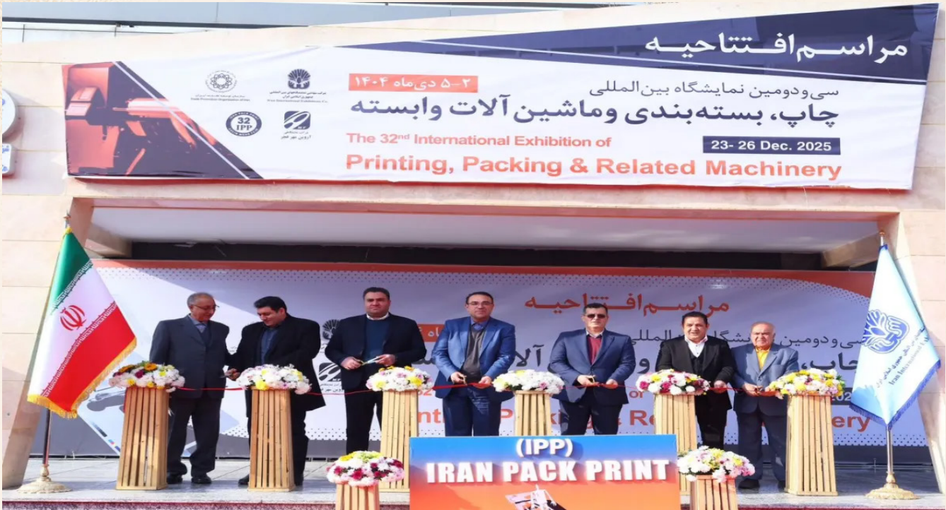
↑ Opening Ceremony – Iran Print Pack & Paper 2025