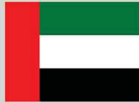
U E A